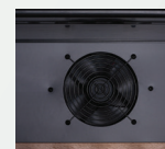
AIR CIRCULATION FAN