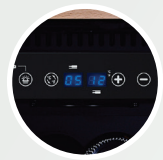
TOUCH SCREEN CONTROL