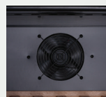
AIR CIRCULATION FAN