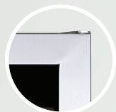
NO TRIM DOOR