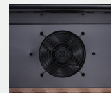
AIR CIRCULATION FAN