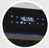
ELECTRONIC CONTROL ON THE DOOR