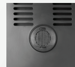
ACTIVATED CHARCOAL FILTER