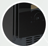
FULL GLASS TINTED DOOR