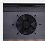
AIR CIRCULATION FAN