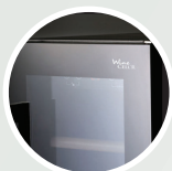
NO TRIM TINTED GLASS

*Capacities are approximate and calculated with Bordeaux bottles type.