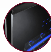
FULL GLASS DOOR

* Capacities are approximate and calculated with bordeaux bottles type.