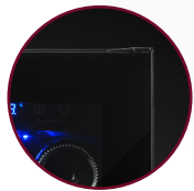
FULL GLASS DOOR