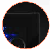
FULL GLASS DOOR