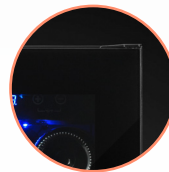
FULL GLASS DOOR

* Capacities are approximate and calculated with bordeaux bottles type.